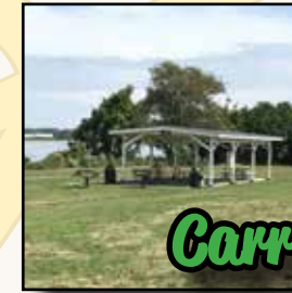
Carr Point Rec Area